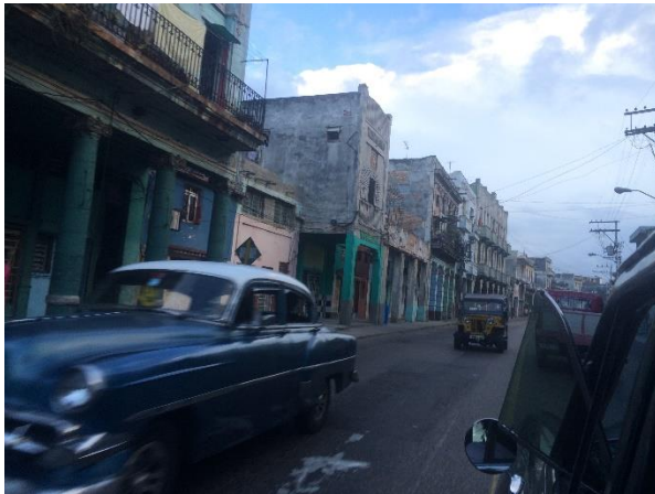
Picture: The Street of Havana, Cuba, and the Old Cars “Almendrones”.

In Section 504 of the Vocational Rehabilitation Act of 1973 and the Americans with Disabilities Act (ADA) of 1990, if a student needs an accommodation, then the Center for Accommodations and Support Services located at UTEP need to be contacted. If you have a condition that may affect your ability to perform successfully in this course, you are encouraged to discuss this in confidence with the instructor and/or the director of the Center for Accommodations and Support Services. You may call (915) 747-5148 for general information about the American with Disabilities Act (ADA) and the rights that you have as a UTEP student with a disability. You also can visit the CASS website at http://sa.utep.edu/cass/ or the CASS office in Room 106 East Union Building. Individuals with disabilities have the right to equal access and opportunity. It is the student's responsibility to contact the instructor and the Center for Accommodations and Support Services at The University of Texas at El Paso.