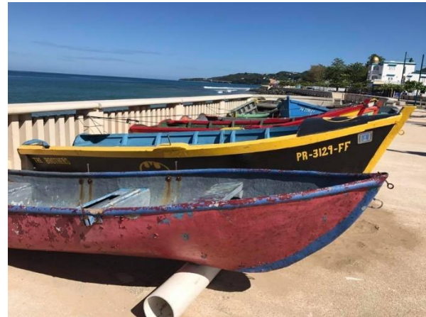
Picture: Boulevard in Aguadilla, Puerto Rico. Aguadilla is a town in the northwestern coast of Puerto Rico. Through the analysis of ethnographic research, we will be able to explore and understand the living conditions, the culture and the government systems in the Spanish Caribbean.