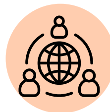
Social Responsibility (SR)