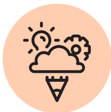
Critical Thinking Skills (CT)

The EL 1301 core curriculum course includes foci on all six TCC Core Objectives: