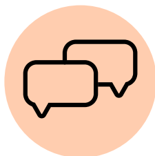
Communication Skills (COM)