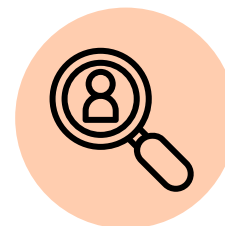
Personal Responsibility (PR)