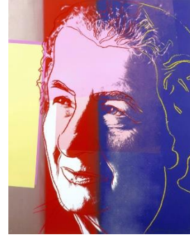
Golda Meir, Ten Portraits of Jews of the Twentieth Century – Andy Warhol (1980)

“One cannot and must not try to erase the past merely because it does not fit the present.”