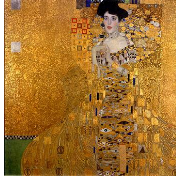
Portrait of Adele Bloch-Blauer I – Gustav Klimt (1907)

“...everything has a past. Everything - a person, an object, a word, everything. If you don’t know the past, you can’t understand the present and plan properly for the future.”