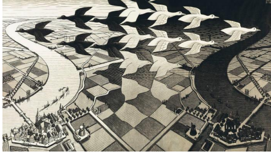
M.C. Escher, Day and Night (1938), woodcut.

“Philosophic contemplation does not, in its widest survey, divide the world into two hostile camps—friends and foes, helpful and hostile, good and bad—it views the whole impartially.”